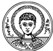
ARISTOTLE UNIVERSITY OF THESSALONIKI